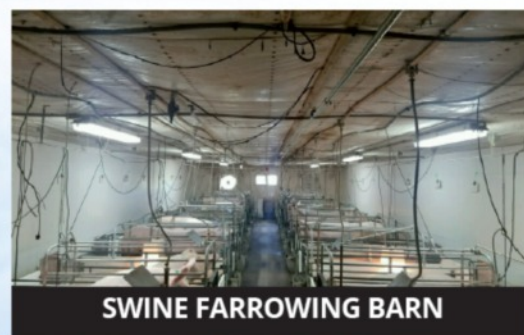
SWINE FARROWING BARN