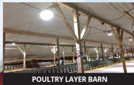
POULTRY LAYER BARN