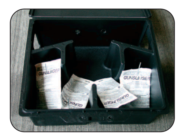
Gunslinger place packs can be secured to rods in a BaitSafe II station for maximum freshness and palatability.