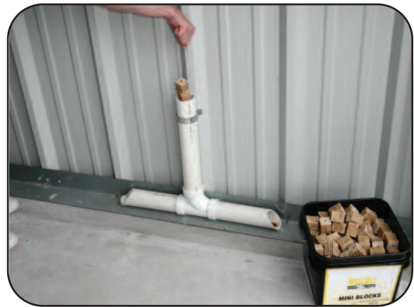
Placement flexibility – several BootHill mini-blocks on a wire inside of a T-tube provide a convenient, secure, self-feeding supply of bait for rodents.