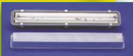
Class III Waterproof Fixture with Injected Acrylic Diffuser

Our completely waterproof fixtures are designed for interior or external use and suited to water, humidity and dust exposed locations. By reducing the maintenance cost, you have an economy saving from 65% to 80%. An energy saving ballast is provided as standard equipment on all our products. Dimmable ballasts are available on some products.