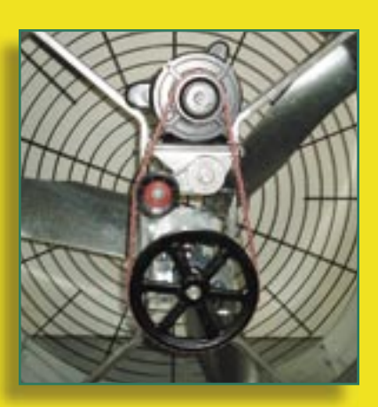
Motor mount and drive assembly utilize a rugged box frame design to increase motor life.