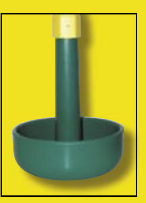
The VAL TurkeyMAX without the angled rim helps prevent bruising.