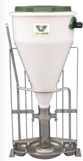
Finisher Feeder – RD-NSF27

With all of the benefits of our Wet/Dry Feeding Systems, they practically pay for themselves. They save you money with low maintenance costs and low feed waste — and by providing high durability and good feed conversion, you'll always have healthy pigs.