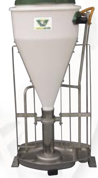
Wean-To-Finish Feeder - RD-NWF24