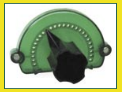
VAL-CO's reliable feed adjustment is quick & precise - in increments that provide the correct amount of feed every time.