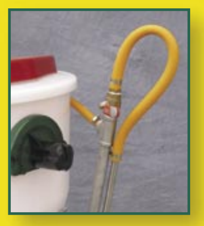
Optional starter water line allows you to place water in the pan for small weaner pigs.