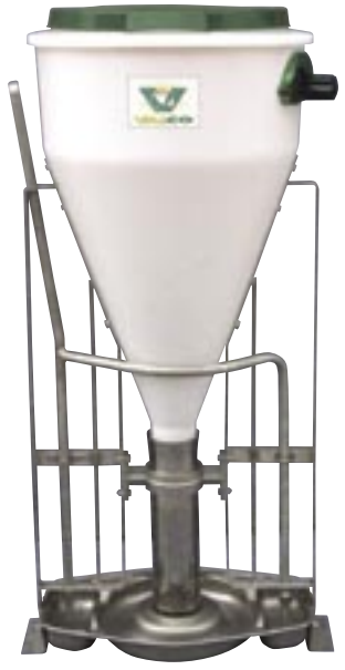
Nursery Feeder - RD-NSN23