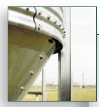
Drip edge directs moisture away from the taper hopper.

Flag System or Feed Line Extensions can be made with the accessories shown to the right.