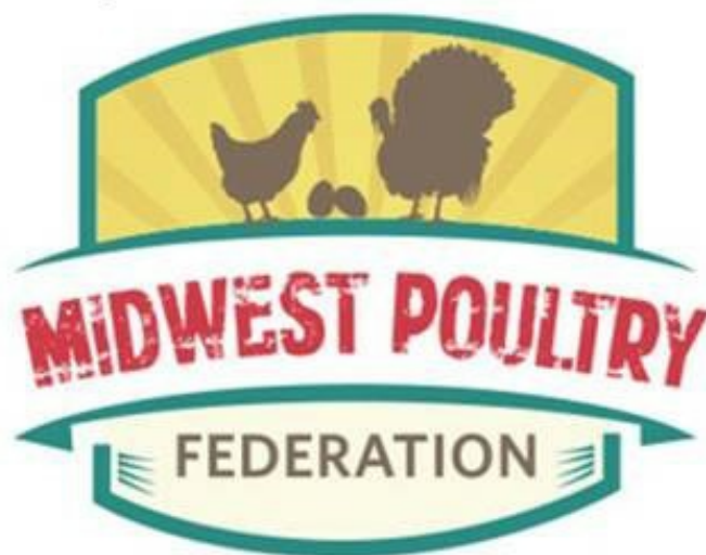
Exhibit Hall open 9:00 a.m. – 2:00 p.m.