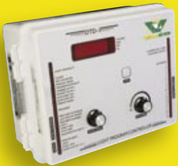
Ask us about VAL-CO Light Program Controllers.