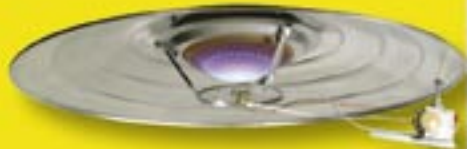
Pancake with Single Jet Burner