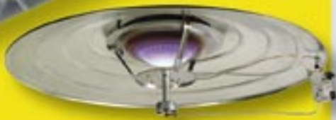
Pancake with Venturi Burner