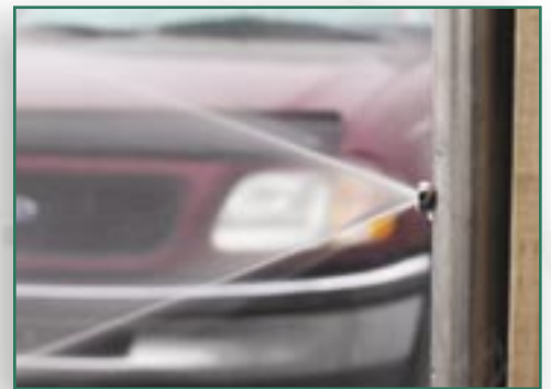
The widespread pattern created by the specially designed nozzles ensures proper and full coverage of the vehicle.

Installed at the vehicle entrance, the Sentry System automatically activates when a car or truck approaches the start sensors. Once activated, the driver slowly proceeds through the Sentry System where twelve specially designed nozzles cover the vehicle or truck with water and the disinfectant of your choice, effectively killing the germs before they can enter your farm. Designed to allow for entry of large feed and catch trucks, vehicles which frequently visit other poultry farms are effectively treated. Once the vehicle is ready to leave, it approaches the Sentry System and is treated again as it exits your farm - giving you peace of mind that you are doing your part to protect your flock and prevent the spread of germs.