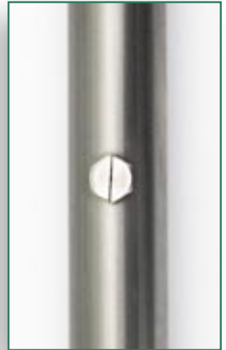
Specially Designed Nozzle