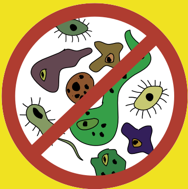
Say "NO!" to the nasties!