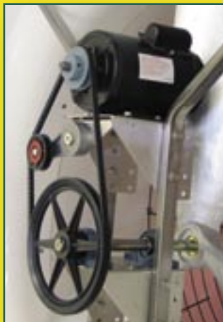
Motor mount and drive assembly utilize a rugged box frame design to increase motor life.

HyperMAX Fans are backed by VAL-CO's long-life warranty - see dealer for details.