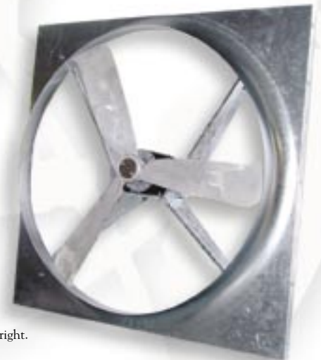
The 48” fan is shown above, while the 36” fan is shown here on the right.