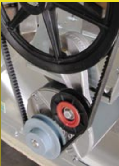
Optional belt tensioner automatically adjusts the belt tension without intervention from the user.