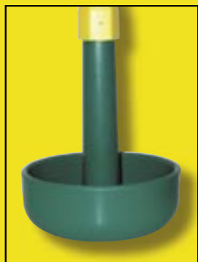
The VAL TurkeyMAX without the angled rim helps prevent bruising.

If you're not convinced a bell drinker is right for your turkeys, we have a watering cup solution for you. Now you can have water access spread out through the house for all your birds. Each cup is a mini-reservoir that can satisfy 30 turkeys up to 7 weeks and 20 turkeys after 7 weeks. The BigTom Turkey Drinker System is small enough for poults, yet tough enough for big toms. And it's easier than ever to use. Simply raise the cups and the water pressure from the front of each line. That's all there is to it!