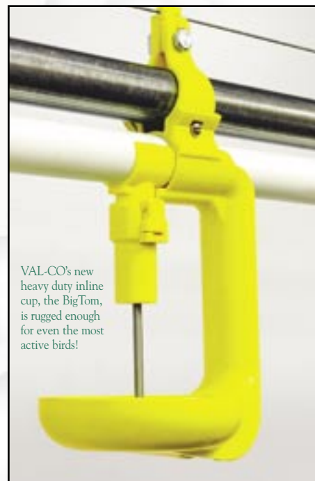
VAL-CO's new heavy duty inline cup, the BigTom, is rugged enough for even the most active birds!