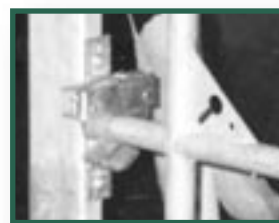
Self Catching Latch