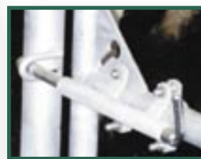
Spring Loaded Latch