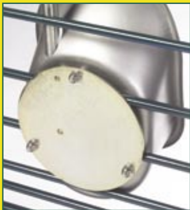
Our mounting bracket holds the drinker securely in place.