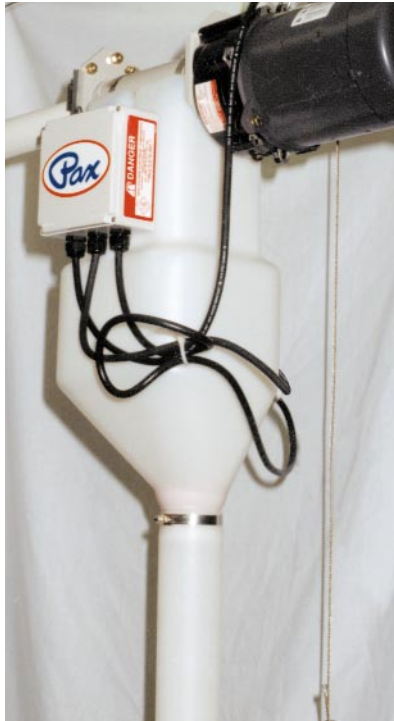
10 lb. end control unit.