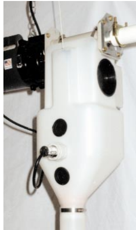
Three ports are provided for mounting the Pax proximity switch to meet your needs. A handy cleanout door is also provided.

For controlled feed rationing in breeding and gestation.