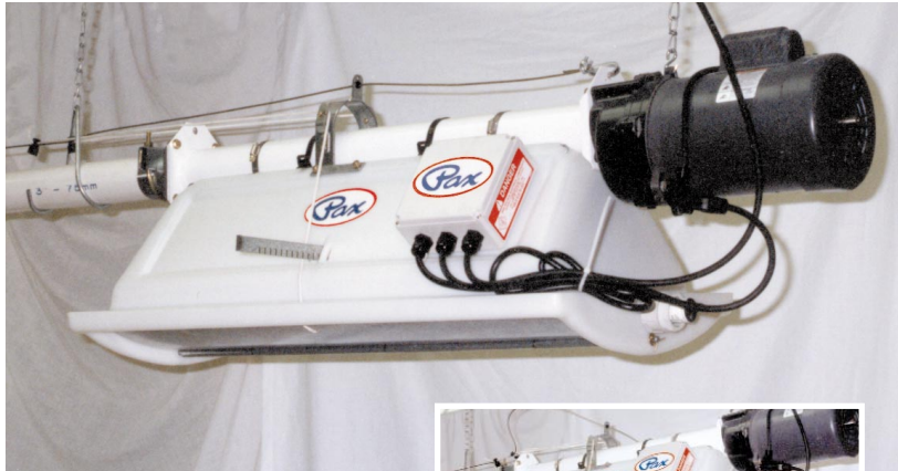
Above, end control unit showing the doors closed. At right, doors opened.