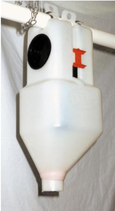
10 lb. drop