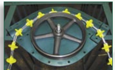
Opened corner unit with chain