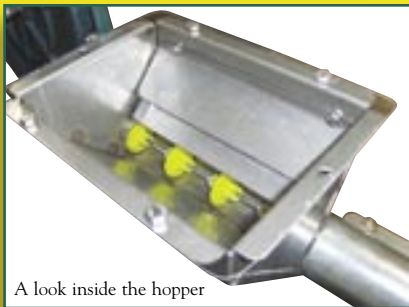
A look inside the hopper