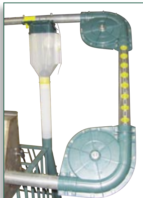
The Sure-Drop Model 770 Series Feed Drop installed on the Chain Disk Feed System

Each feeding session begins by “dropping” feed. Then while animals are eating, the system automatically refills for the next feeding session. The system’s proximity switch stops the fill system after all drops are filled to their individual preset volumes. The automated control or trip lever simultaneously releases feed from all drops on the system.