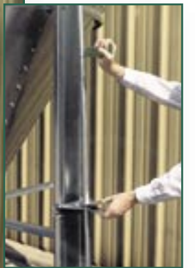
Above, the VAL-CO pinch-lock lid opener is easy to operate.