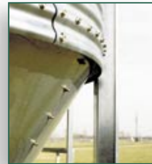
Drip edge directs moisture away from the taper hopper.