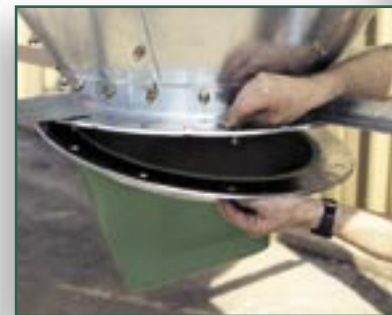
Boot attachment with the VAL-CO split collar allows for fast, easy installation.